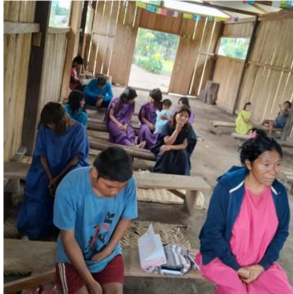
Group in Pamakiari