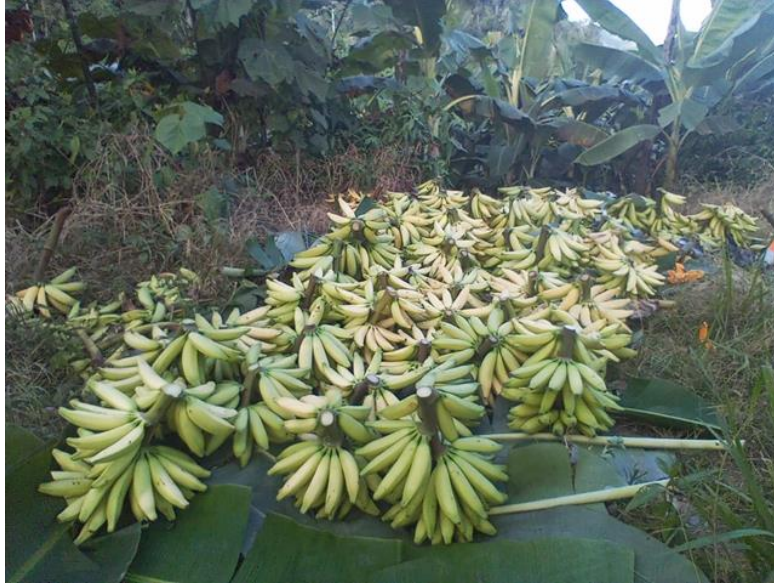
Harvested bananas waiting for buyer.