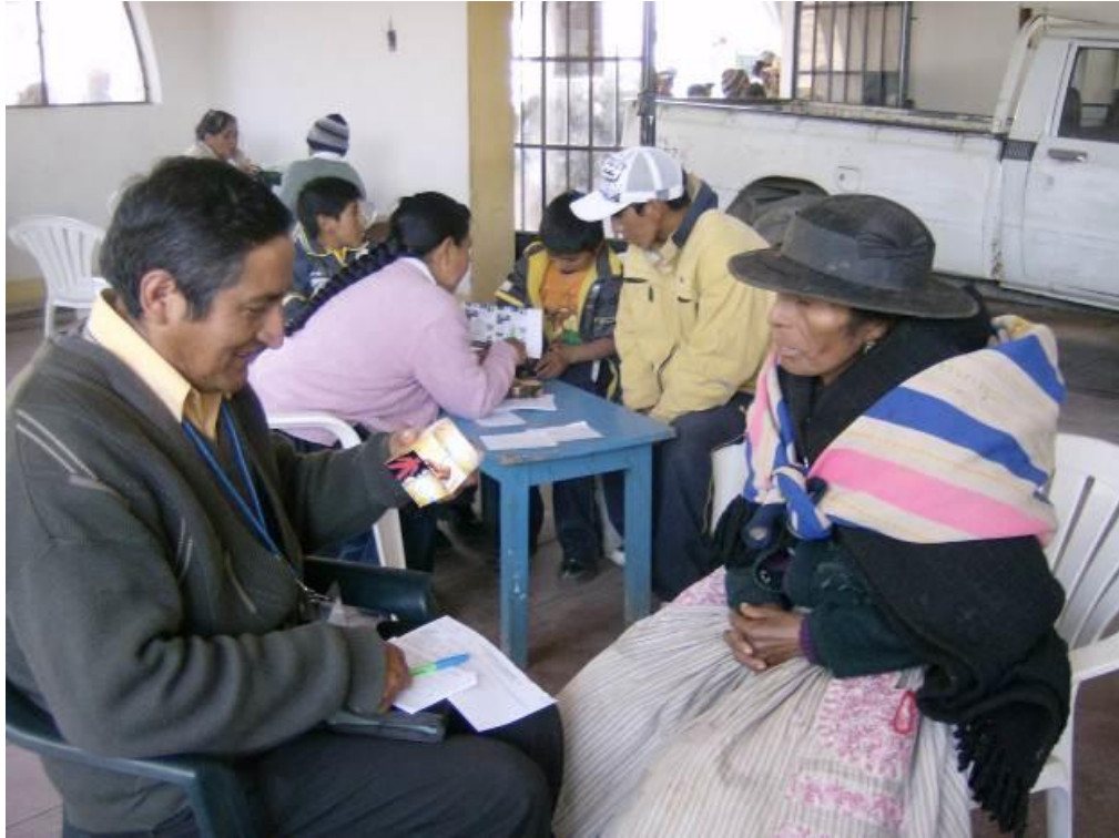
Sharing the Gospel to one of the patients during the medical mission.