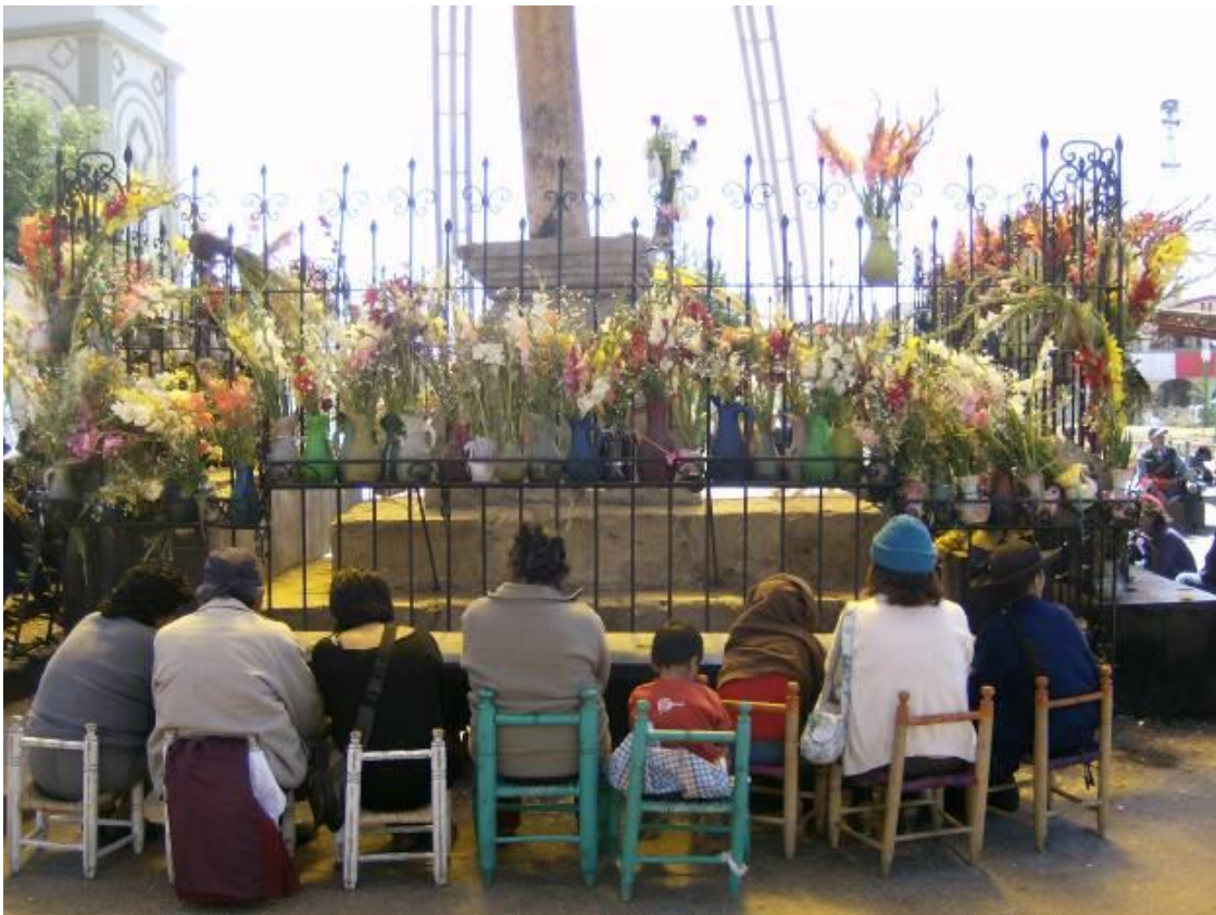
People worshipping the cross in Chongos Bajo.

In September, we had a very busy and fruitful month. Covenant United Methodist Church from Dothan, Alabama came and conducted a medical campaign with us in Chongos Bajo, a small town which is about 30-45 minutes from where we live in Huancayo. Chongos Bajo is a town where there is a lot of idolatry, and people come there to worship the oldest cross in Peru. We conducted the medical campaign right across the street from this cross, and many people were there worshipping it. There were also candles around the cross, and many people take the melted wax from these candles to fortune tellers to find out about their future.