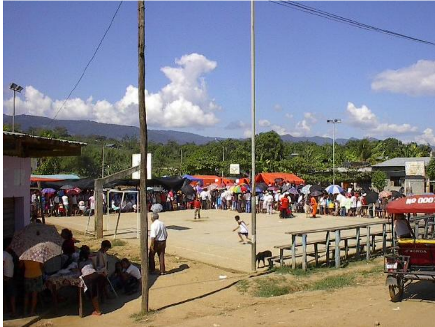
Medical Mission in Tarapoto