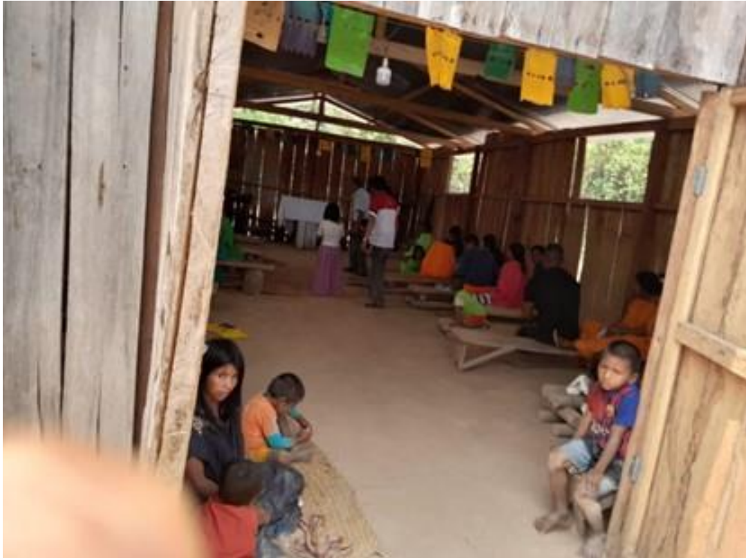
Group in Tsiapo