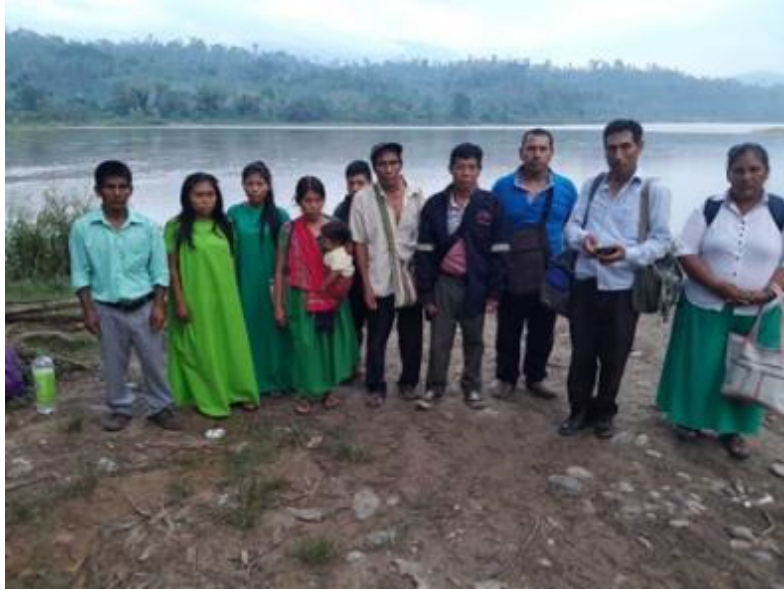
New group in Ashaninka community of Pampa Hermosa.