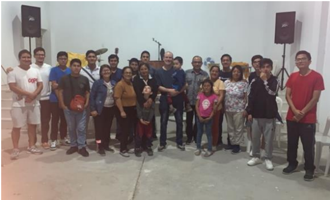
Group in La Merced