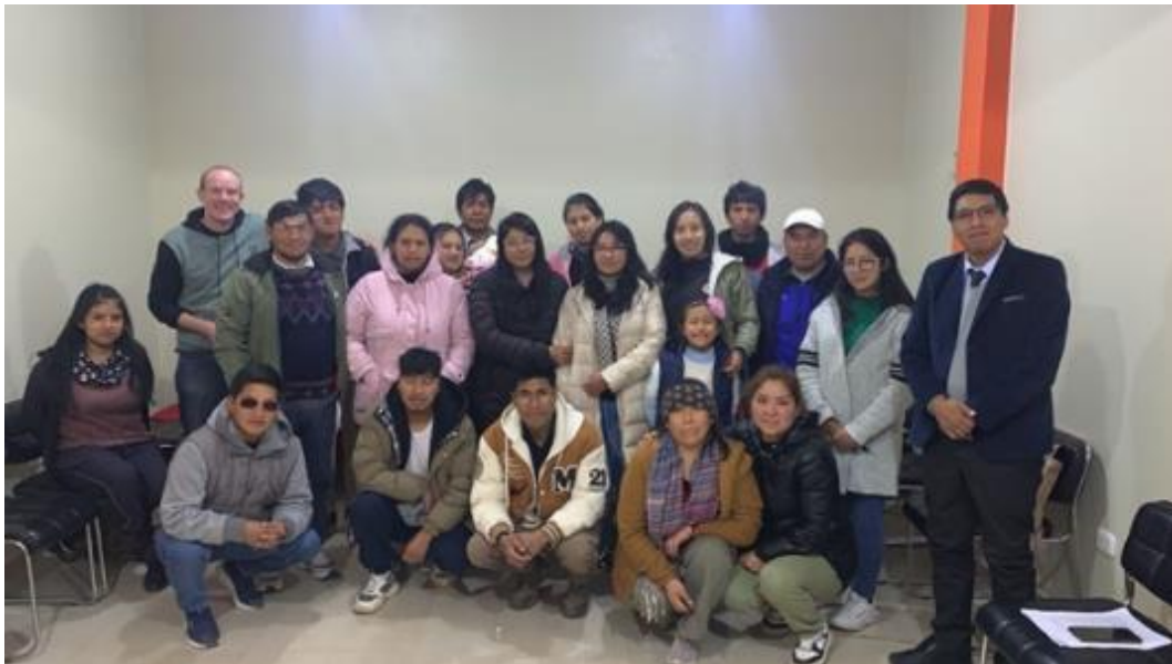
Group in Huancavelica