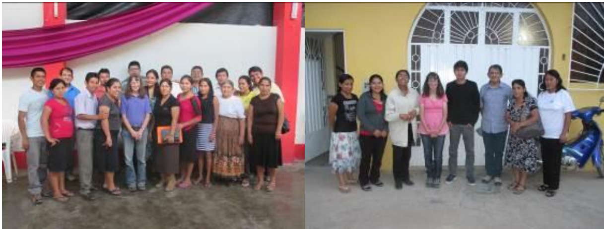
Leadership workshop group in Castillo Grande