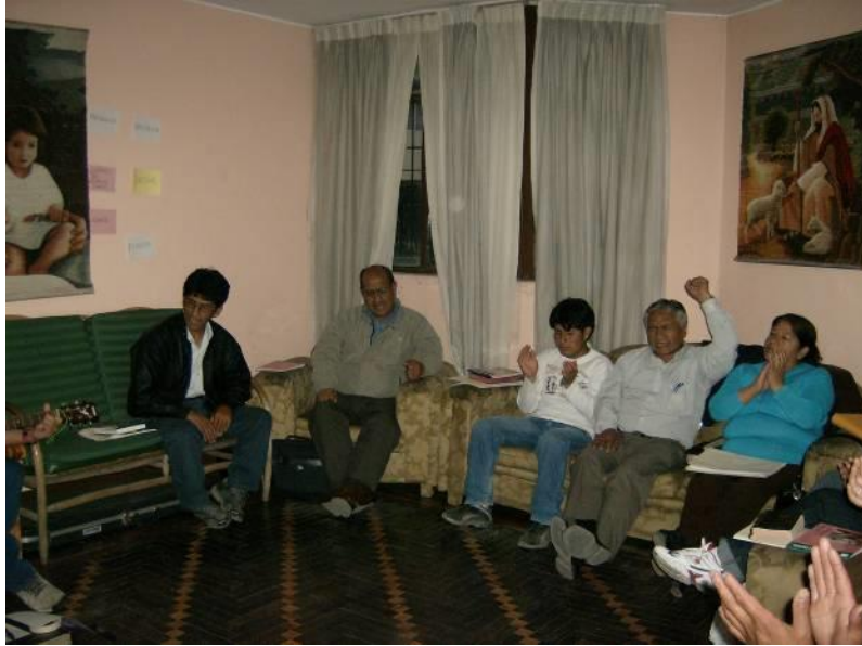
Prayer time during the leadership workshop.