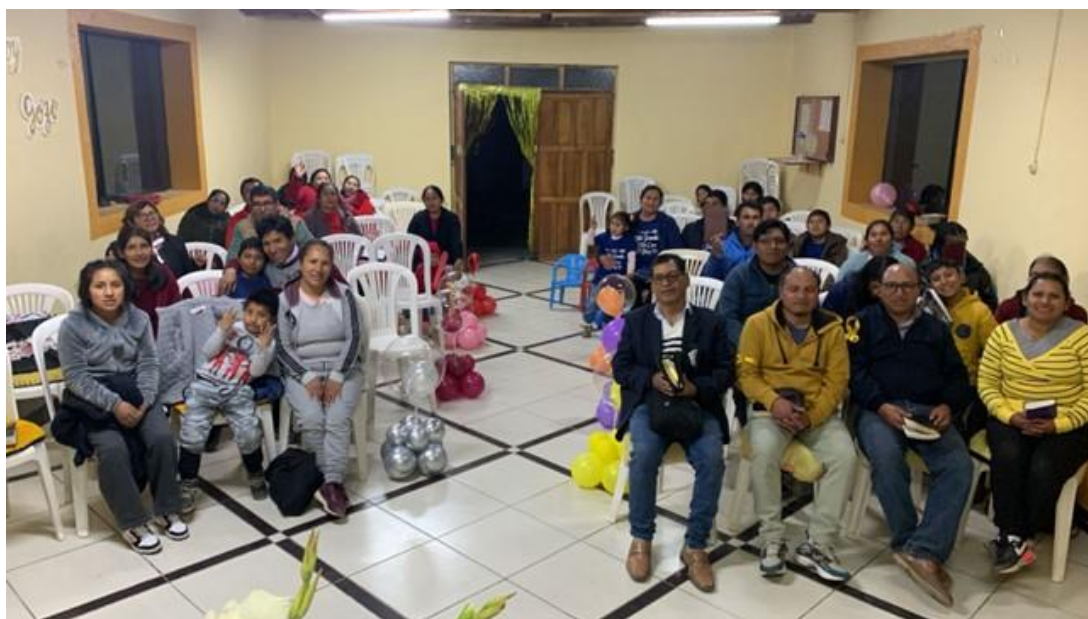
The Church group in Huari.

This month, the brothers and sisters in the Huari church invited new people to participate in the Wednesday night Bible study. Last year, a medical campaign was conducted there, and they have been trying to follow up with some of the people that participated.