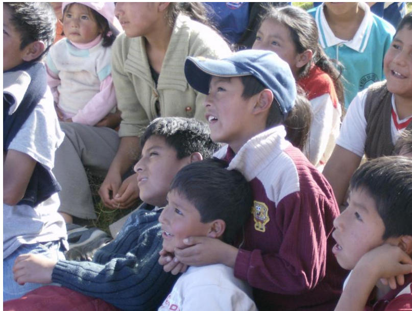
Children watching the puppet presentation in the Club at Pichcus.