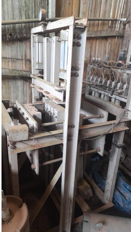
Bottle blowing machine