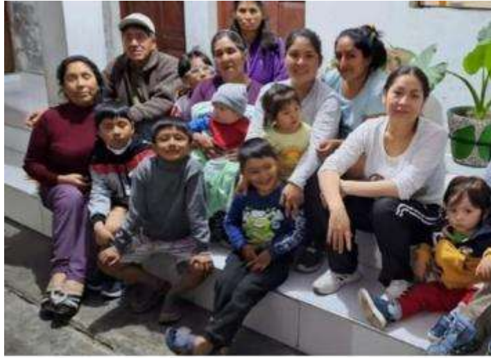
Children in Huancavelica.

Work on the farm has been challenging recently. There has been a lot of rain late in the season, and this has caused the highway to have more landslides than normal, and as a result, there have been many delays on the highway getting to the farm.