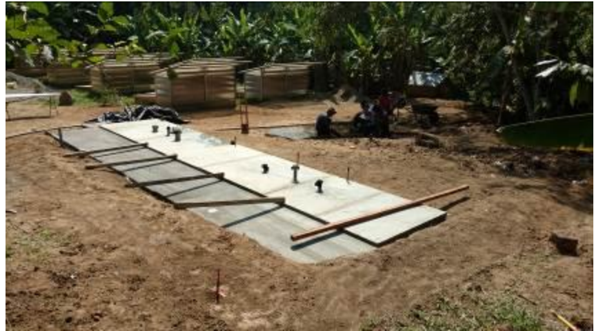
Finished bathroom floor and side walk.