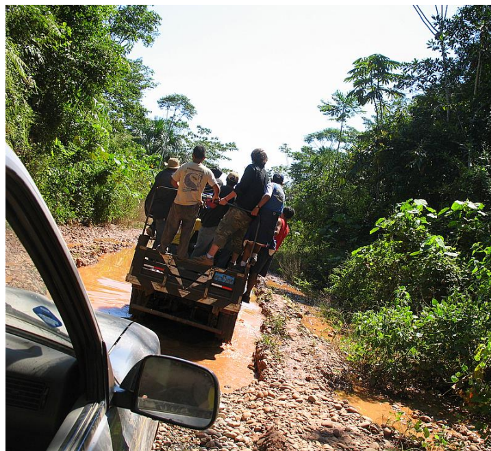
The team traveling from Bermudez to Palcazu.