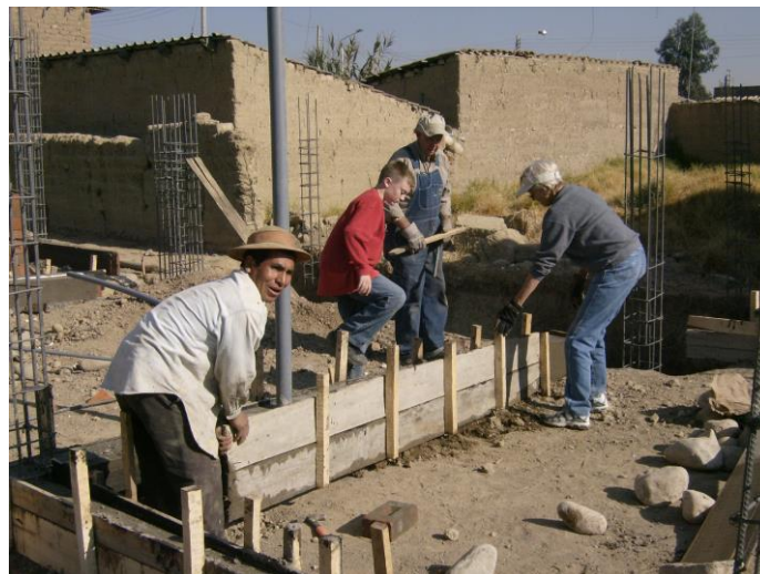
Constructing the sub-walls.