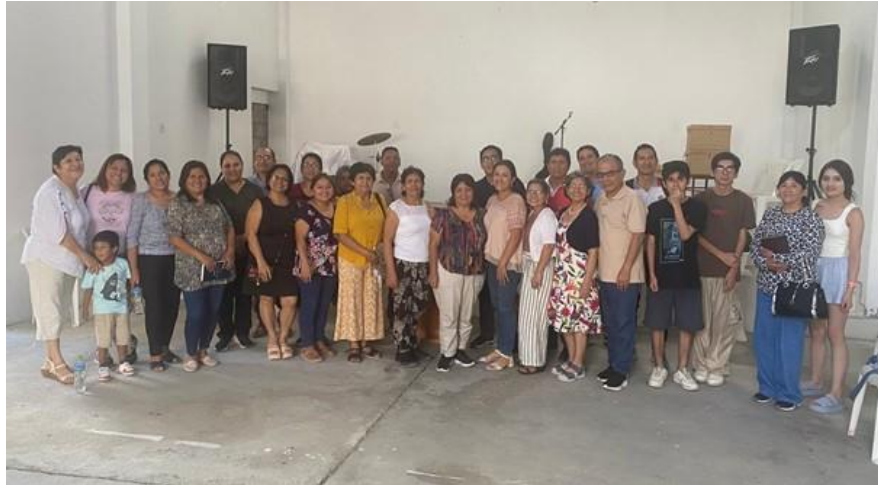
Participants in the Intermediate Level Workshop in La Merced