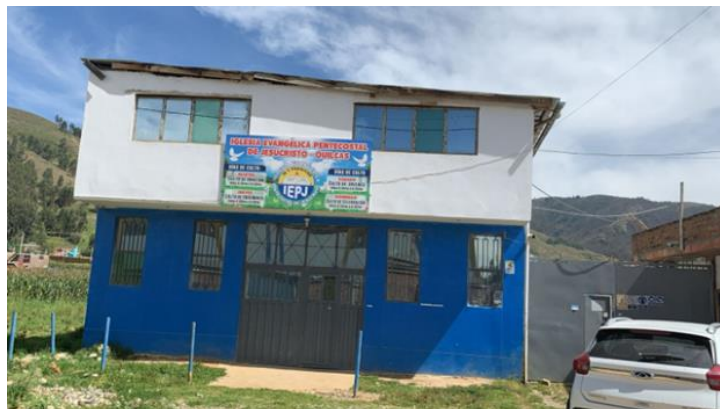
Church building in Quilcas