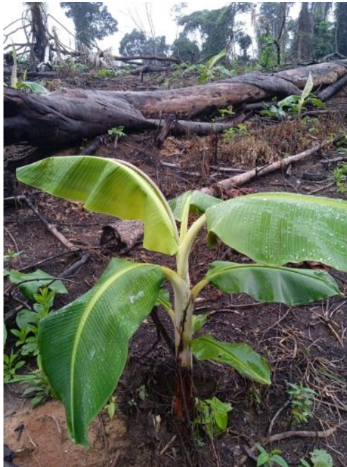
New banana plants.

The farm team finished with the planting of new banana trees, and they still need to spray the plants and possibly put lime on them too.