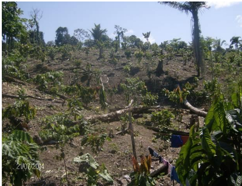
Area of cacao on the farm.

The farm project continues to advance well. Luis Lermo has done a good job managing the farm. The cacao is growing well and we have grafted approximately 2200 of the plants with grafts from highly resistant, highly productive plants. Luis has also planted crops like cucumber, tomato, papaya, banana, beans, soy, watermelon, chia, and several other crops. These crops will provide food for his family and other farm workers, as well as serve as experimental crops for possible future production. Benjamin and Arthur are also doing research and design for solar dryers for the farm as they will be necessary in about a year to a year and a half, to dry the cacao when the plants start to produce.