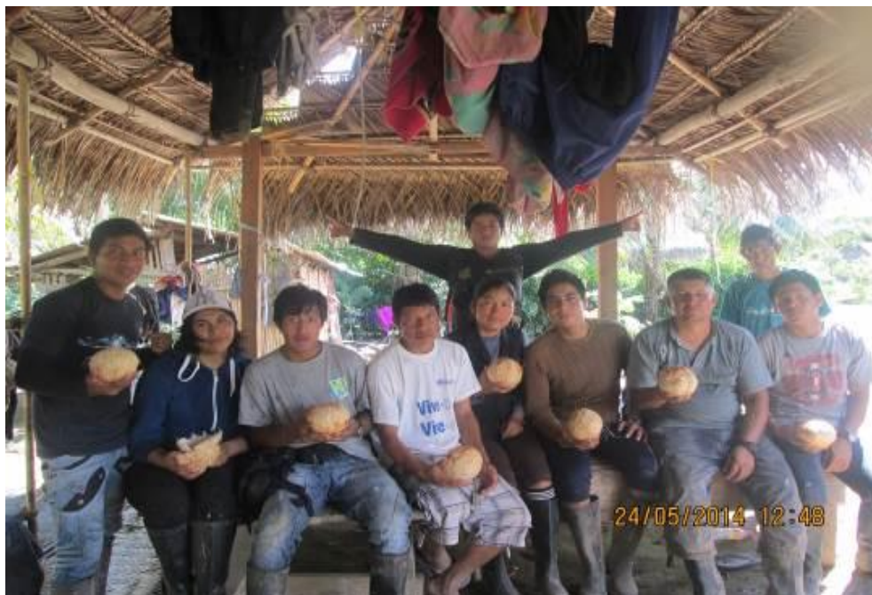
National Missionary team that works with the Ashaninkas.