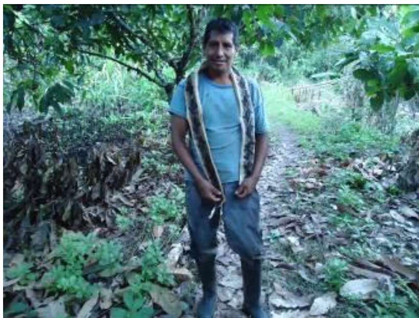
A reward for one of the workers clearing the land.

Arthur is still working on the agricultural project in Pangoa. The first 25 acres of the site has been cleared and planting of the first crops should start in September. The road to the site has now been constructed to within five kilometers of the project. Arthur and Ricardo are working on forming another company to run the farm project to take advantage of recent tax laws that give breaks to organizations that are involved in developing this area of the jungle. This will result in a savings of 19% in sales taxes and a reduction from 30% to 10% on earnings. Please be in prayer that the project will continue to move ahead and that God will bless it, so that it will start producing income to support the ministry in the next 2 to 3 years.