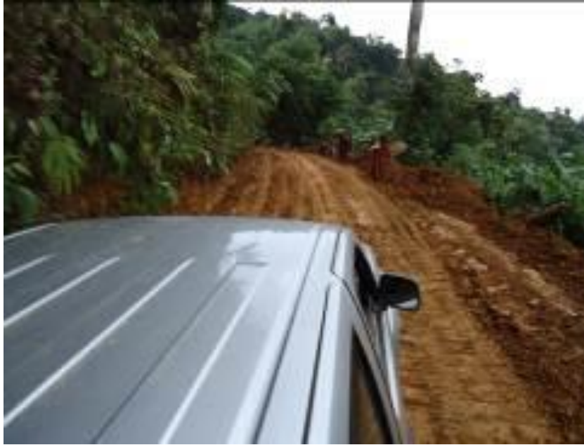
Ashaninka tribes people walking along the new road near the agriculture project.

Arthur is still working on the agricultural project in Pangoa. The first 25 acres of the site has been cleared and planting of the first crops should start in September. The road to the site has now been constructed to within five kilometers of the project. Arthur and Ricardo are working on forming another company to run the farm project to take advantage of recent tax laws that give breaks to organizations that are involved in developing this area of the jungle. This will result in a savings of 19% in sales taxes and a reduction from 30% to 10% on earnings. Please be in prayer that the project will continue to move ahead and that God will bless it, so that it will start producing income to support the ministry in the next 2 to 3 years.