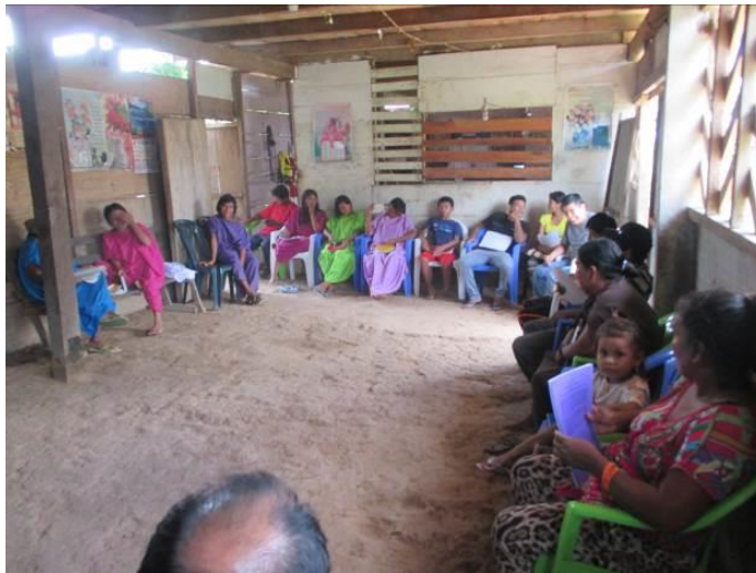
Basic level leadership workshop group.