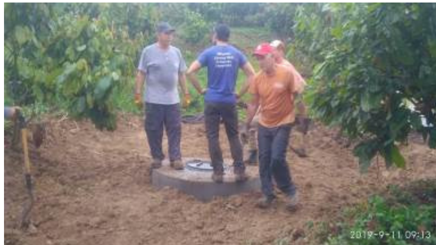
Concrete casing around water collection tank completed.