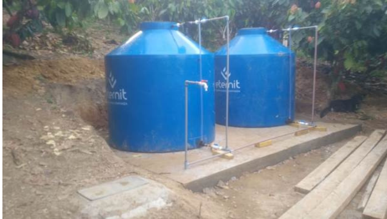
Water storage tanks completed and connected to the system.

Pastor Beto, Pedro, and Darwin were very busy this month discipling others. They conducted a basic leadership workshop for three days in Chilca and in San Lorenzo. They also made a number of follow up visits with some families from Huamancaca Chico, where we did the medical campaign in August. They have been investigating different places for next year's medical missions in addition to leading their normal discipleship groups. The possible places right now are San Pedro de Saños, San Lorenzo, Jauja, and Vista Alegre.