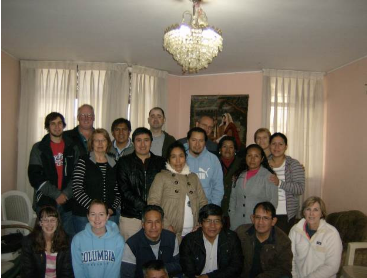
Sozo training team and trainees.

team that came and for all the freedom that He will give to those that are willing to have this prayer. Please pray for wisdom for us as we try to develop a Peruvian leadership team for this Sozo ministry, and pray for wisdom for our leaders as they begin to use it in their own community and culture.