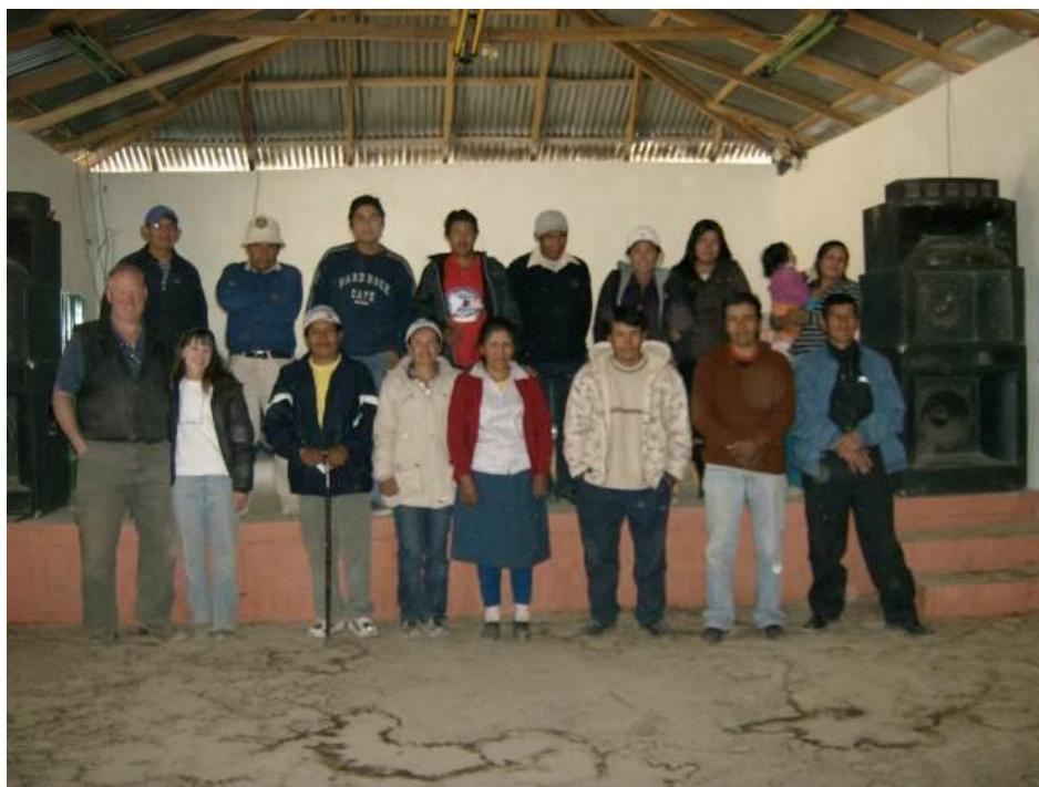
Leadership Workshop Group in Maricasa.