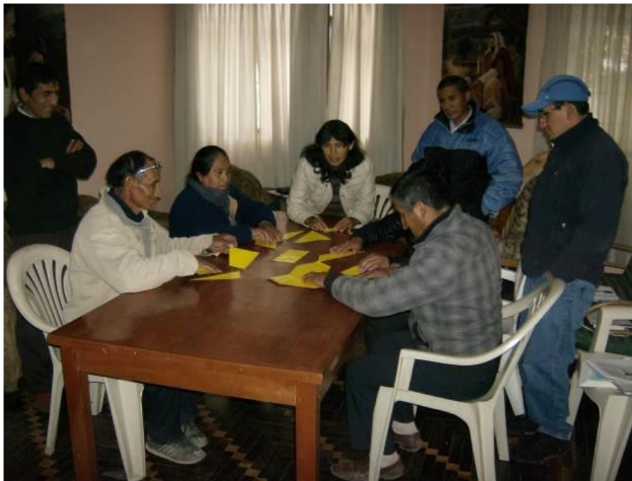
Activity during the Leadership workshop in Huancayo.