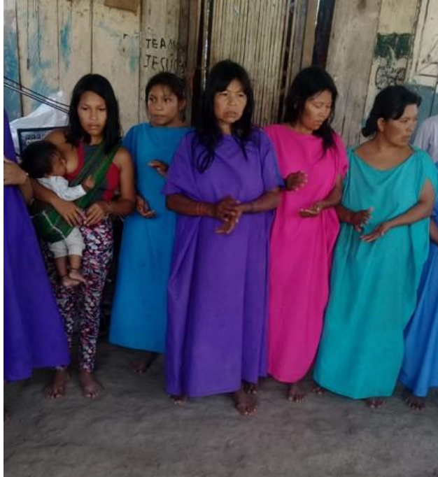
Some of the new believers in Kutivireni.