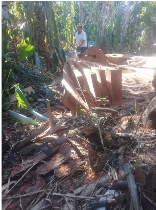
Preparing the lumber in Boca Anapti.