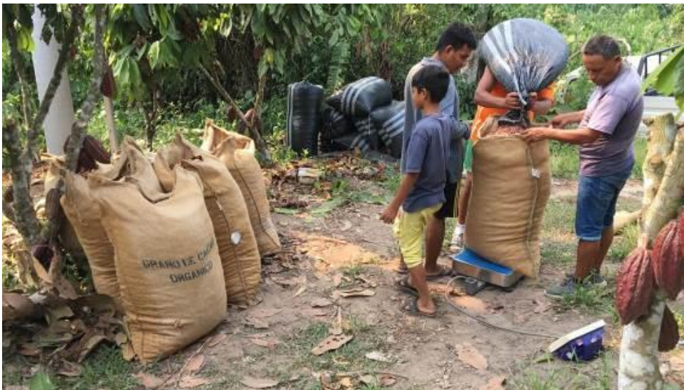
Bagging and weighing the cacao for export.

Bernabé reported to us that they have almost finished the expansion of the meeting place they use for discipleship in Boca Anapati. It is a good thing as it has finally started to rain here after a very long drought. Except for the $10.00 we gave them for gas for the chain saws they provided all the materials and did all the work themselves.