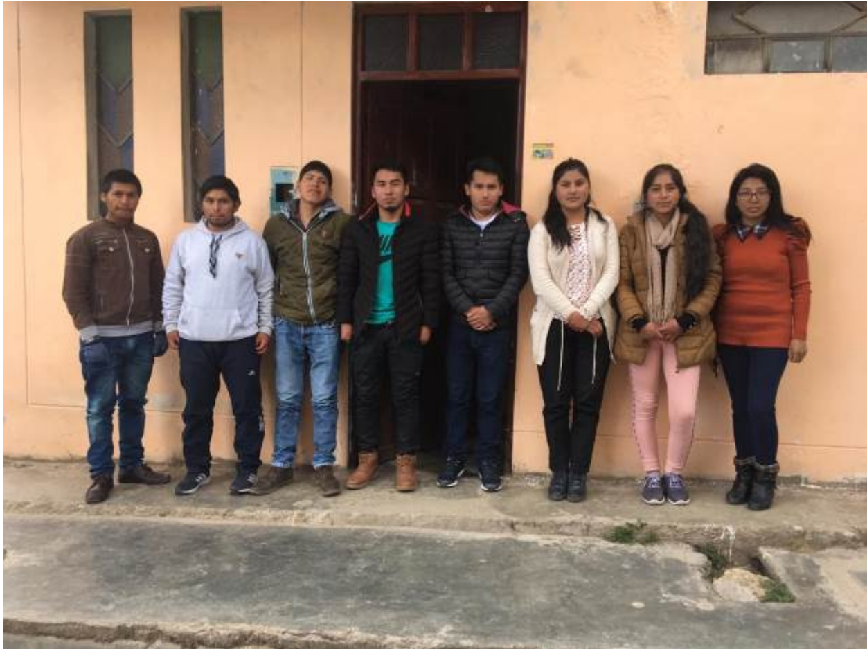
Workshop participants in Huancavelica

involved in several religions, such as Buddhism, Shintoism, Confucianism, and in occult practices, such as witchcraft. After participating in the workshop and studying the Bible, he accepted the Lord Jesus as his Savior and Lord. Please pray that God will continue to work in the hearts of the youth in Huancavelica.