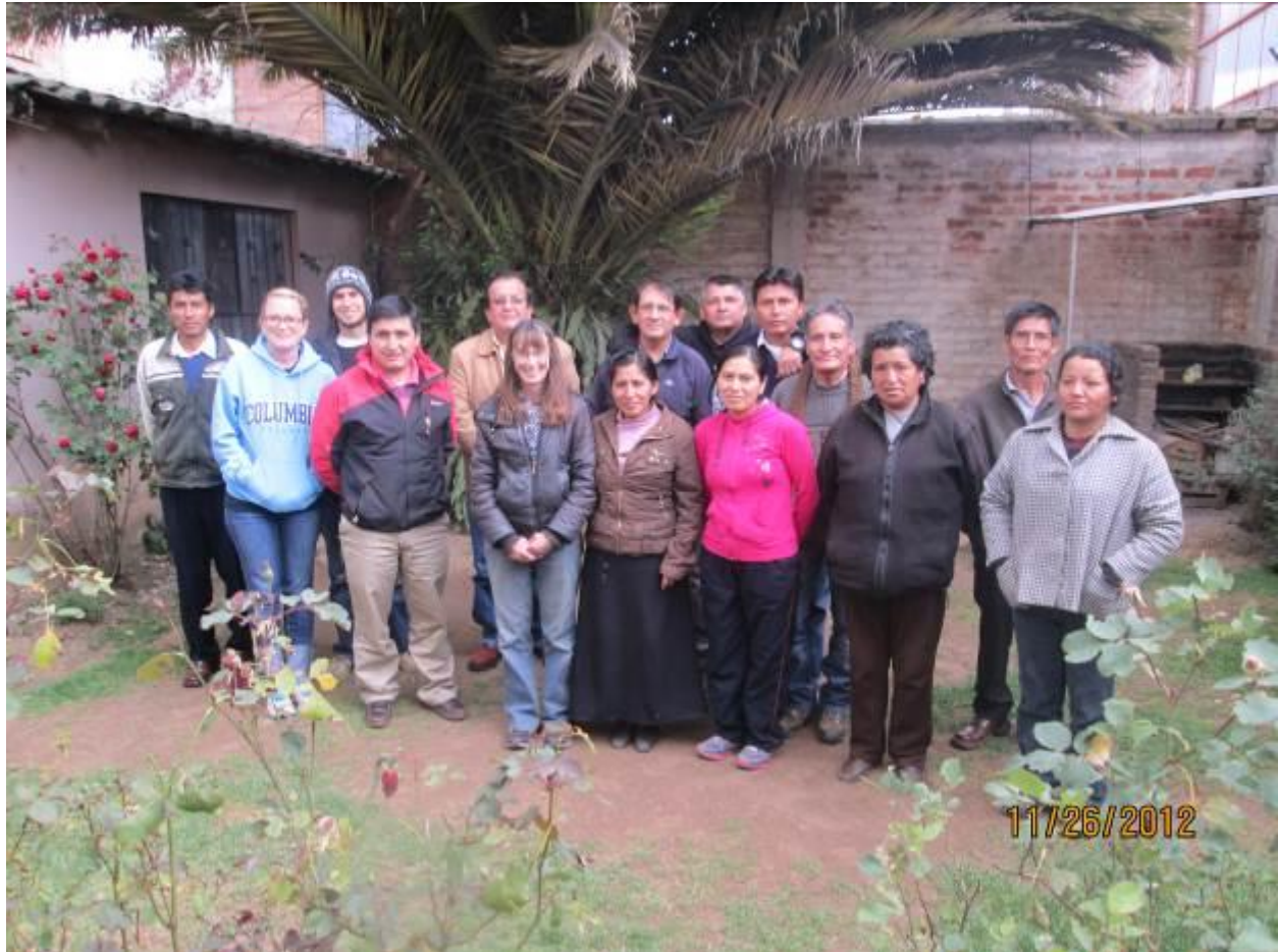
Some of our key leaders in the ministry.

For example, many marriages have been reconciled. Also, many couples that were living together got married, while others were baptized, without their leaders saying anything to them about these things. The Word of God changes lives. The other workshop was a basic workshop for people who had just begun or want to begin discipleship. Even though there weren't a lot of people in this workshop, the people who came seemed to really enjoy it and are excited about putting it into practice.