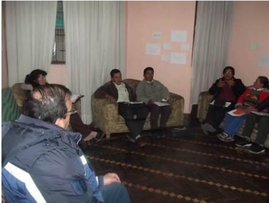
Participants in Level II leadership Workshop.