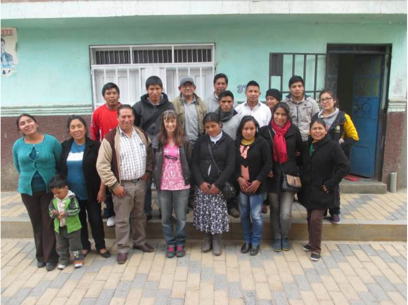
Huancavelica workshop participants: