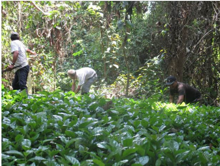
Jorge and the transplant contractors examining the coffee plants.

The farm project is moving steadily moving forward. It has finally started to rain again, and we can now graft the remaining plants. The grafting process is scheduled to start in mid-December. Approximately 30% of the cacao should start producing in the next few months. We expect the production to increase throughout the next year and for the plants that are being grafted now to start producing early in 2017. The land and the coffee plants are ready for transplanting to the field. This work will begin in mid-December as well. Work on the road to the farm is progressing, as well. Please pray that it will be able to continue through the rainy season. Arthur and Moisés have just about completed the prototype dryer for the chocolate beans. Arthur will now be preparing the plans and specifications for the final design of the dryer, so construction of production models can begin.