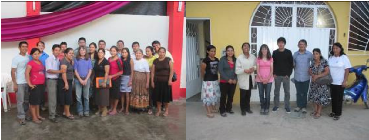
Leadership workshop group in Castillo Grande