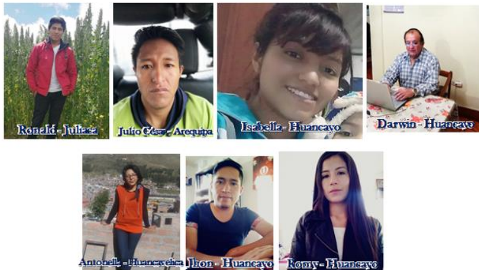
Leaders that are guiding additional groups in Inductive Bible Study.