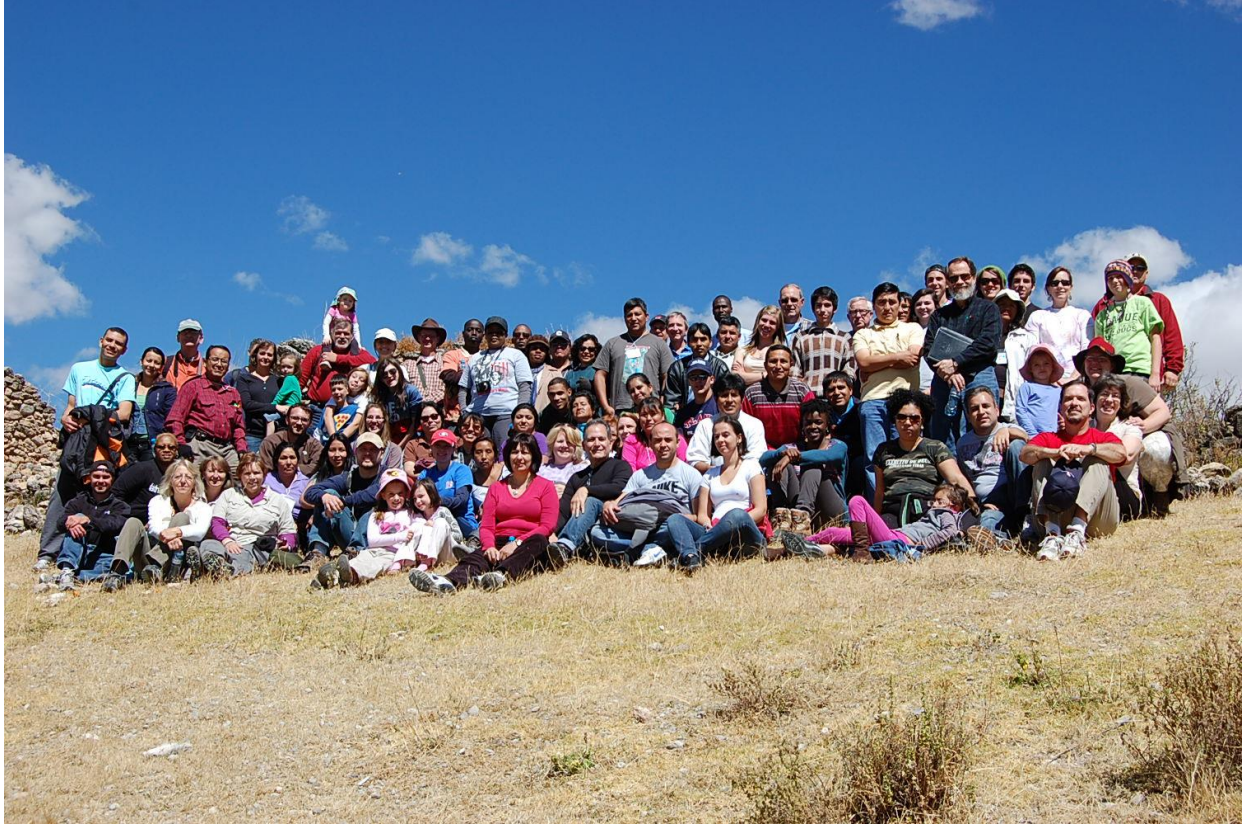
Group from the new missionary training event in 2011.

We will be coming home for four months starting in November of this year, in order to try to raise additional support for the ministry. If you would like for us to share about the Peru ministry with one of your church groups, Sunday school classes, or a group of friends interested in missions in your home, please don't hesitate to contact us to schedule an opportunity.