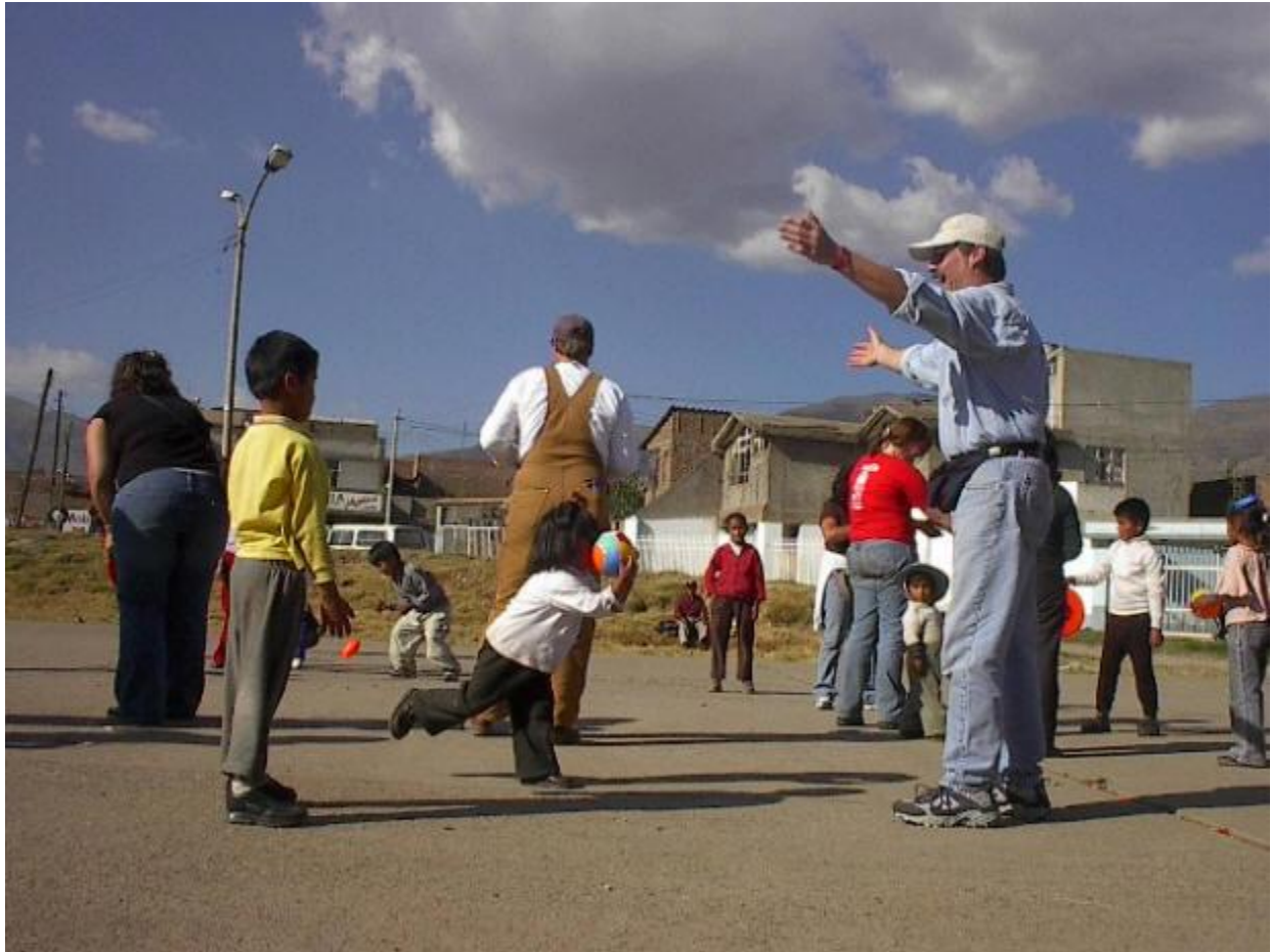
Lewis Memorial team helping with new Kid's Club at Mariatigue.

love with others who don't know Christ personally. Please be in prayer for the future fruit of this ministry.