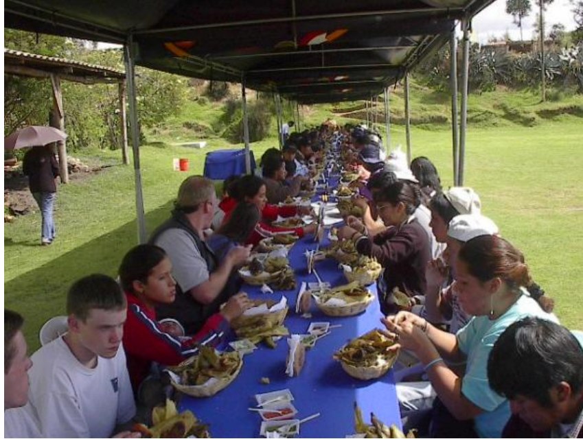
Labor Day celebration with discipleship groups.