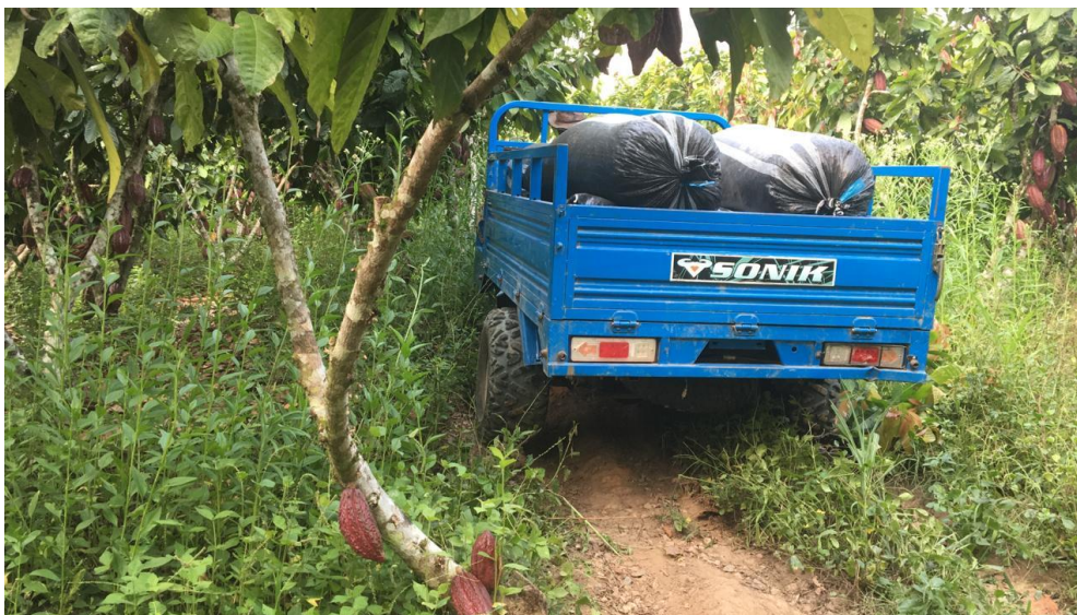
Furgoneta loaded with Cacao.