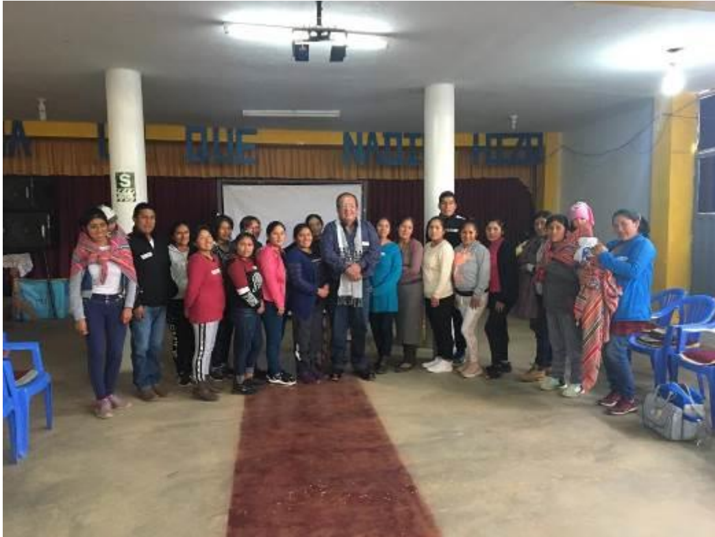
Group in Quilcas for the workshop on Biblical Family Values.

A workshop on “The Family” was held in Quilcas. This workshop was used to not only promote Biblical family values, but was also part of the celebration of the International Women’s Day.