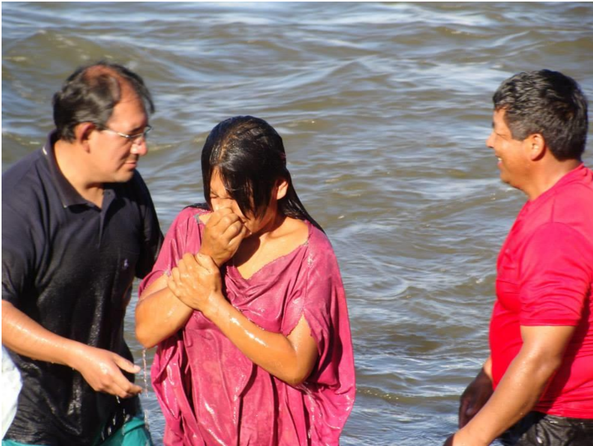
Baptism in the Anapati River