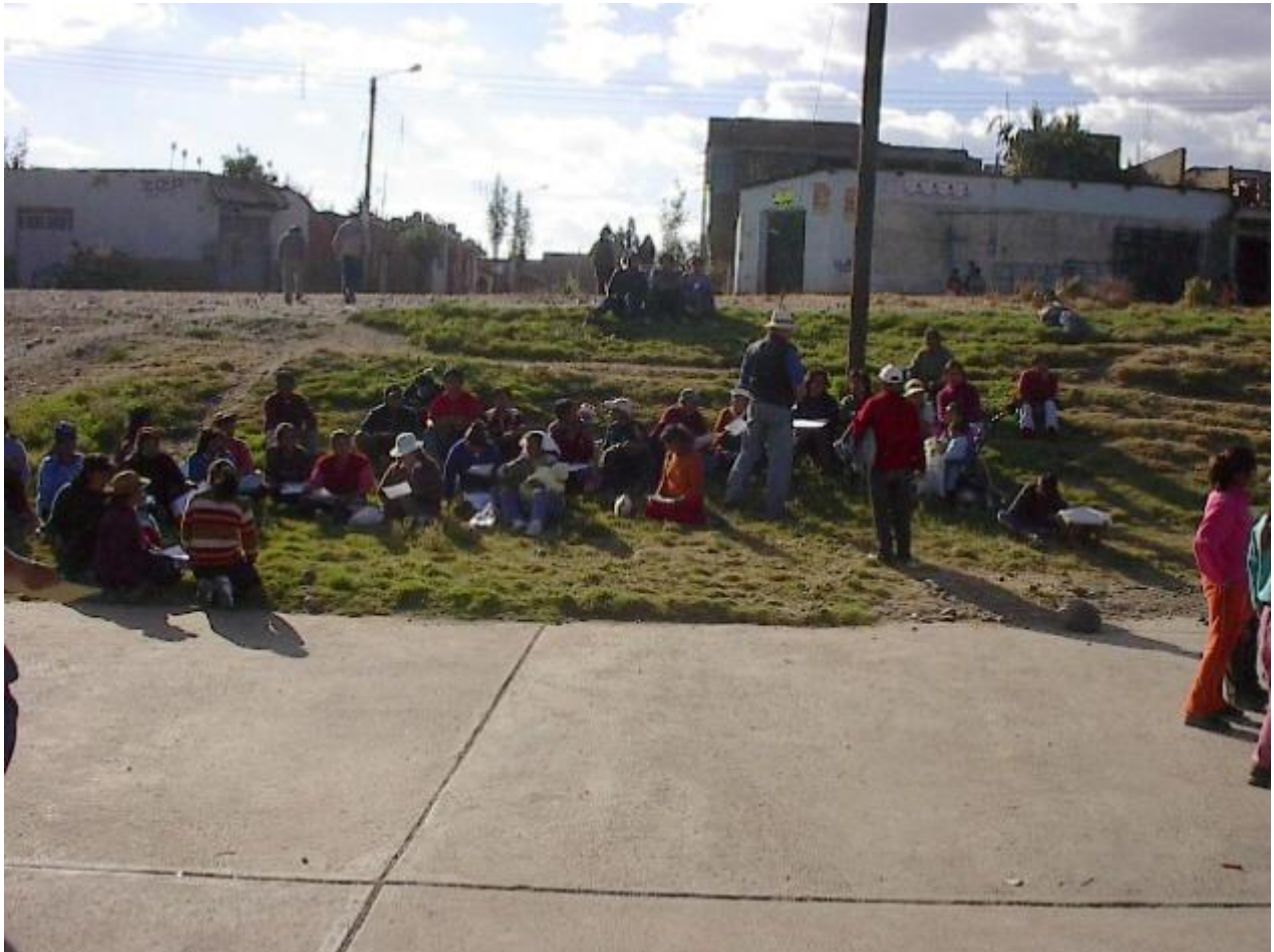
Adult group at Mariatigue Kid's Club