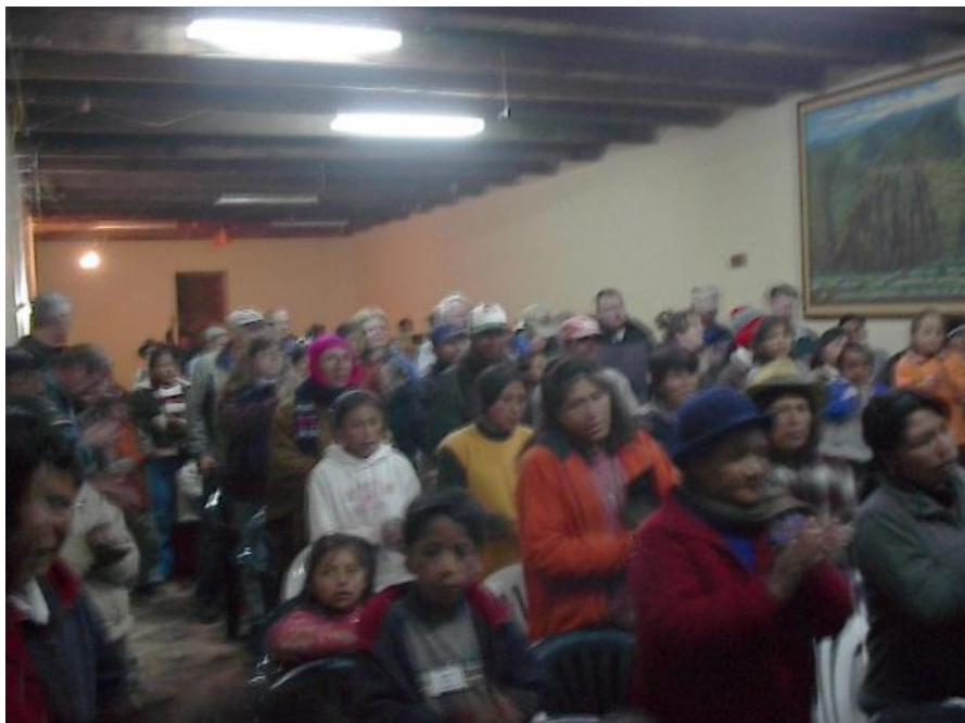
The last night's evangelistic celebration.