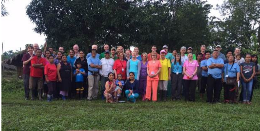
Yoyato Mission Team