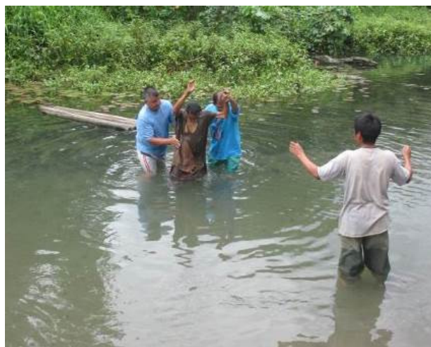
Baptism of one of the new believers