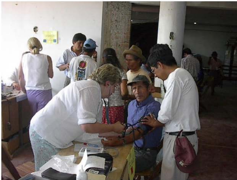
Assisting a patient in San Martin de Pangoa.

A medical team of 23 from Mayo United Methodist Church in Paintsville, Kentucky joined by a Peruvian team of 20 made the long trip to San Martin de Pangoa to share God's love with the people in that region. This area was one of the last areas to be freed from the hold of the Shining Path Terrorists and still suffers from great poverty. During the four days of medical attention given by this team they treated approximately 1650 persons for medical, dental, or eye problems. During the clinic almost 300 people gave their lives to Jesus Christ as Lord and Savior, and in the open air events each evening even more responded to the invitations. As a result of this clinic the local government donated a small plot of land to the Methodist Church for the construction of a new church building in the city.