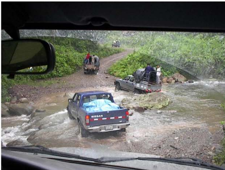
Traveling to Puerto Bermudez.

June was a month of receiving answers to prayers. We were blessed to have two medical teams from Kentucky work with us this month in two of our most remote churches. The people in these churches are isolated by distance, difficult travel conditions and poverty. We and the people of these churches have been praying for over a year that God would send them a blessing and encourage them in their work. During the month of June God answered these prayers. A medical team of 30 from Morehead United Methodist Church in Morehead, Kentucky joined by a Peruvian team of 25 made the difficult trip to Puerto Bermudez. This trip required three days of travel to get in and three days to get back out.