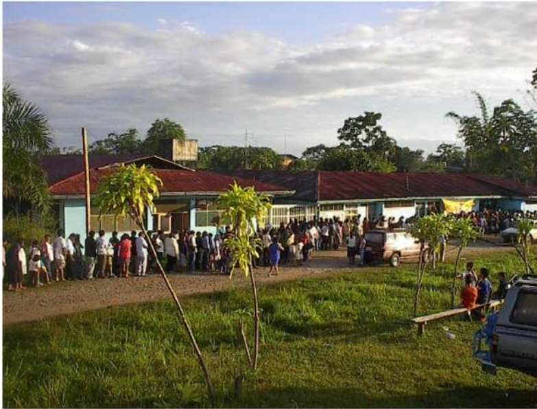
Line of persons waiting for medical attention in Puerto Bermudez.

A medical team of 23 from Mayo United Methodist Church in Paintsville, Kentucky joined by a Peruvian team of 20 made the long trip to San Martin de Pangoa to share God's love with the people in that region. This area was one of the last areas to be freed from the hold of the Shining Path Terrorists and still suffers from great poverty. During the four days of medical attention given by this team they treated approximately 1650 persons for medical, dental, or eye problems. During the clinic almost 300 people gave their lives to Jesus Christ as Lord and Savior, and in the open air events each evening even more responded to the invitations. As a result of this clinic the local government donated a small plot of land to the Methodist Church for the construction of a new church building in the city.