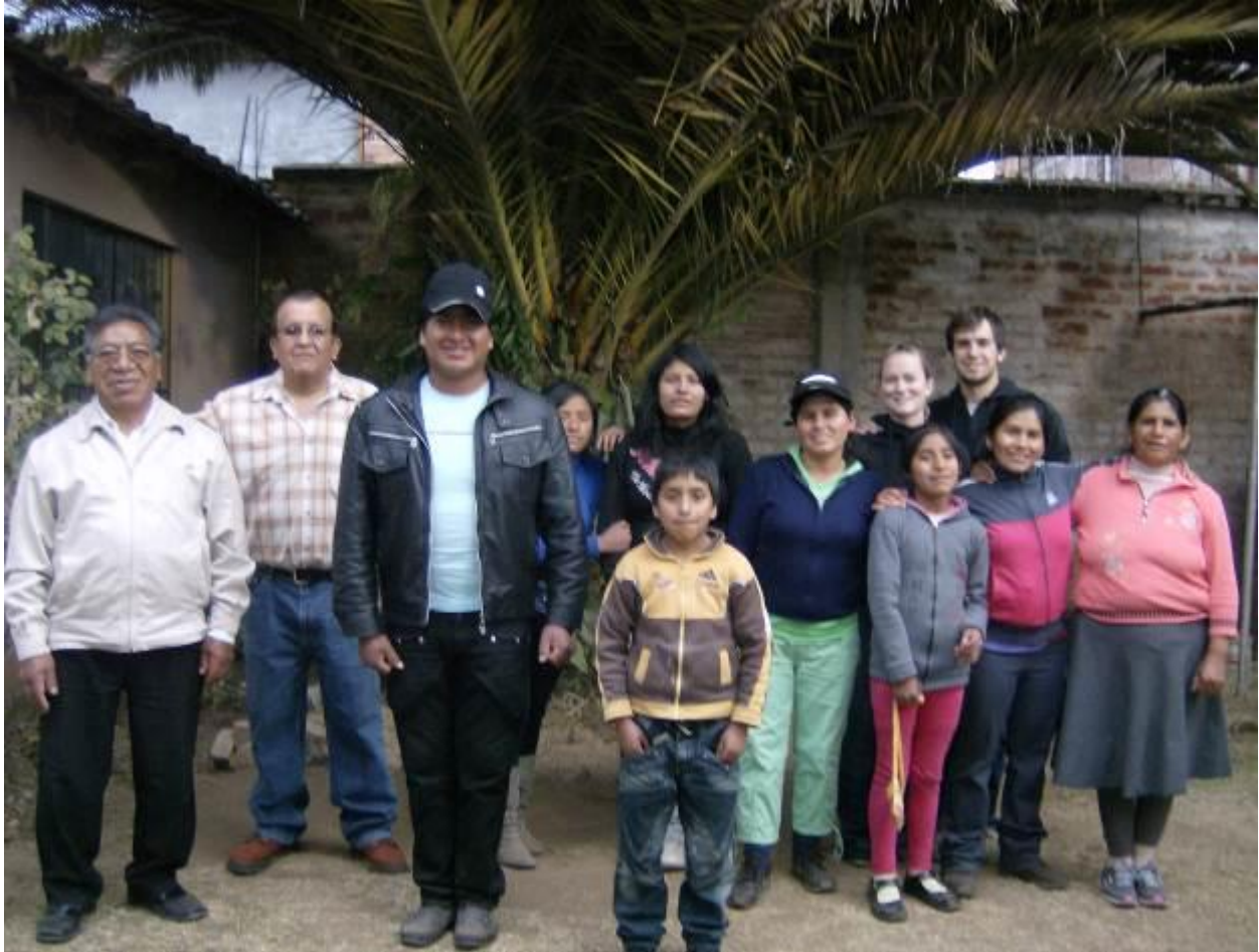
Teachers from San Pedro de Saños