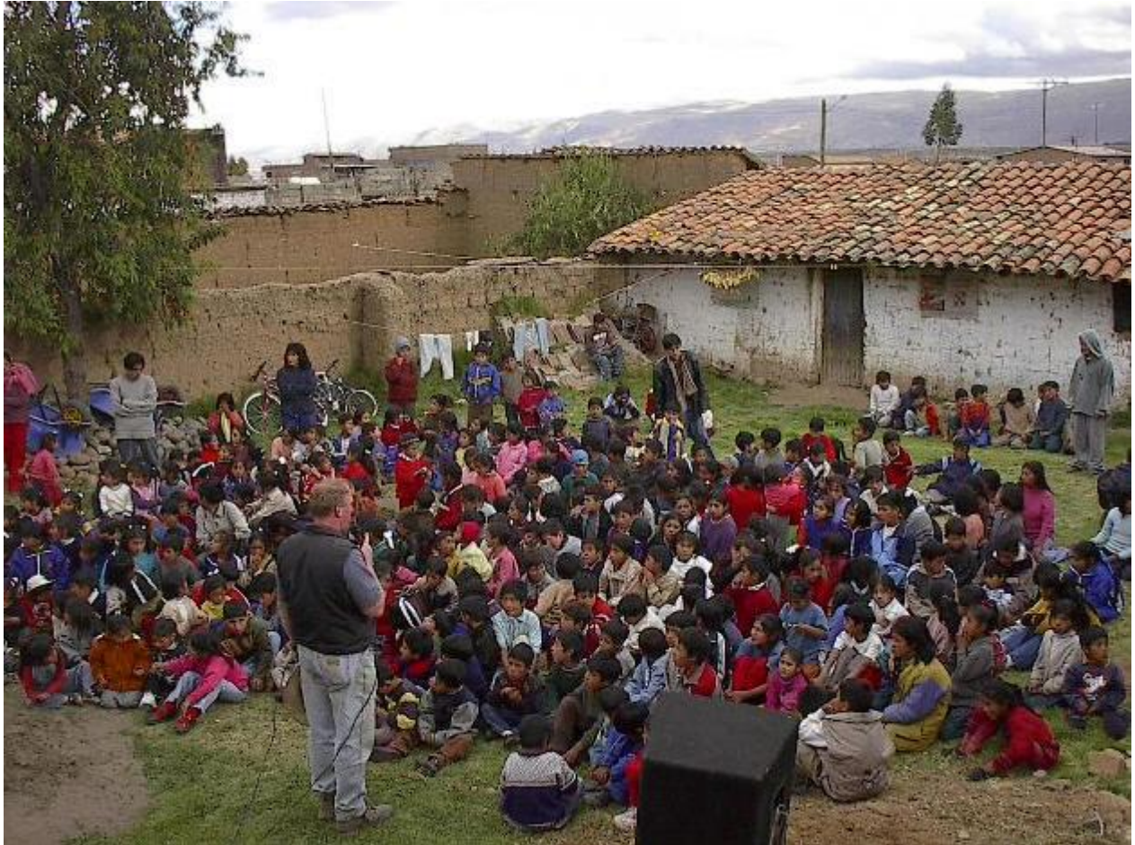
First Day's Bible School in San Jeronimo.

The medical team from Frazer Memorial UMC worked in the jungle city of Satipo. During their week of ministry they provided medical attention to around 2000 persons. The group also provided eyeglasses to aid many who could not see well. Each one of these persons also received spiritual counseling, which resulted in over 500 first time professions of faith in Jesus Christ. Terrorism was strong in Peru as few as five years ago and the terrorist groups still exist. In the jungle, the Shining Path Terrorist group still operates to a limited extent. A few of the patients made it known to us that they were involved in the terrorist activity. We pray that the treatment and love shown to them during their visit to the medical event will be an agent for change among this group.