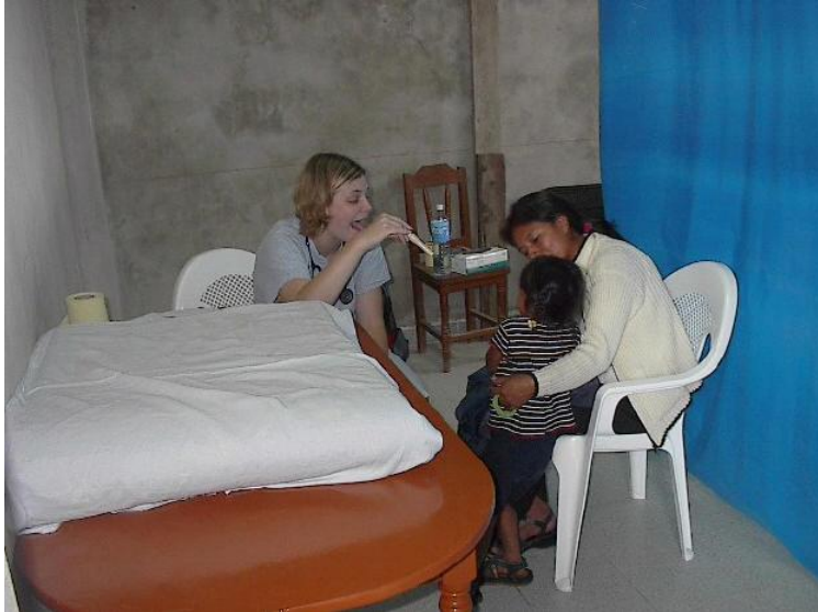
Team member providing treatment to a mother and child in Satipo.

The discipling team from Sugar Hill UMC helped to make possible the first district wide youth retreat in recent history for the youth of the Sierra and Selva District. Youth leadership representing each church within the district, including one of our Kid's Clubs and our Thursday night cell groups, attended this event. In all there were 150 persons in attendance. Many of the pastors attended as counselors and indicated that they received a great deal of benefit and spiritual growth from the event as well. The team from Sugar Hill prepared and presented the teachings on subjects, such as evangelism, spiritual disciplines, and relationship building. The district youth leaders did an excellent job in the planning and preparation of the event. We were blessed to see the fruit being produced by these leaders, that we have worked with over the last two years, as they demonstrated through their actions toward others the meaning of "servant-leader".