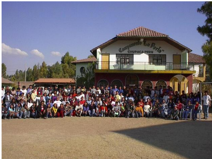
District youth that attended the Youth Retreat.

The discipling team from Sugar Hill UMC helped to make possible the first district wide youth retreat in recent history for the youth of the Sierra and Selva District. Youth leadership representing each church within the district, including one of our Kid's Clubs and our Thursday night cell groups, attended this event. In all there were 150 persons in attendance. Many of the pastors attended as counselors and indicated that they received a great deal of benefit and spiritual growth from the event as well. The team from Sugar Hill prepared and presented the teachings on subjects, such as evangelism, spiritual disciplines, and relationship building. The district youth leaders did an excellent job in the planning and preparation of the event. We were blessed to see the fruit being produced by these leaders, that we have worked with over the last two years, as they demonstrated through their actions toward others the meaning of "servant-leader".