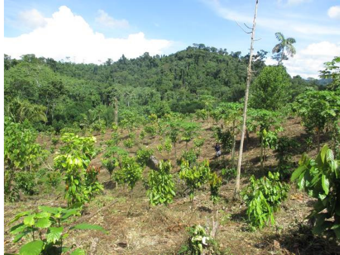
Lúcio in the middle of the cacao plants.

August. We are anticipating that initial production from the plants will begin to occur in the August to October 2016 time period. In addition to the cacao, clearing of an additional 10 hectares for planting coffee is in process. The coffee will take approximately two years to start to produce after it is planted.