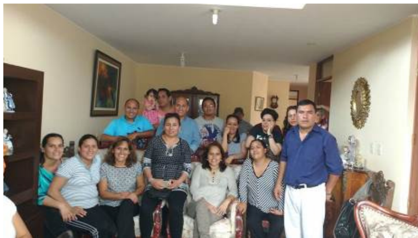
Leadership workshop group in Lima.