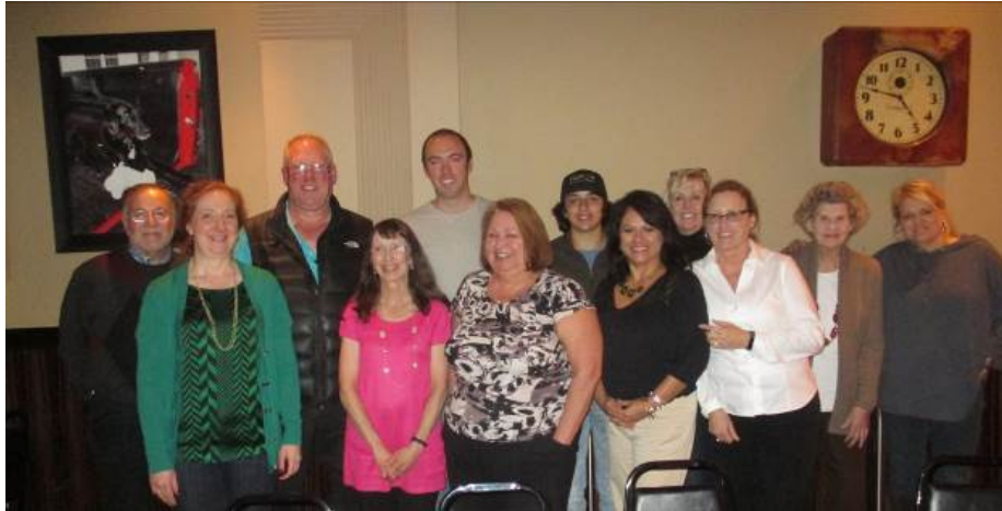
A group of our long time supporters from Evans, Georgia.

taking us out to eat as we share with them. Praise God that He has touched the hearts of some new people to become involved with us in the ministry in Peru! We just wanted to thank you for those of you who have met with us or who will meet with us in the future, as well as for those that are so faithful to continue supporting us with your prayers and with your gifts. God is using you in a great way to advance His Kingdom. We couldn't do it without you.