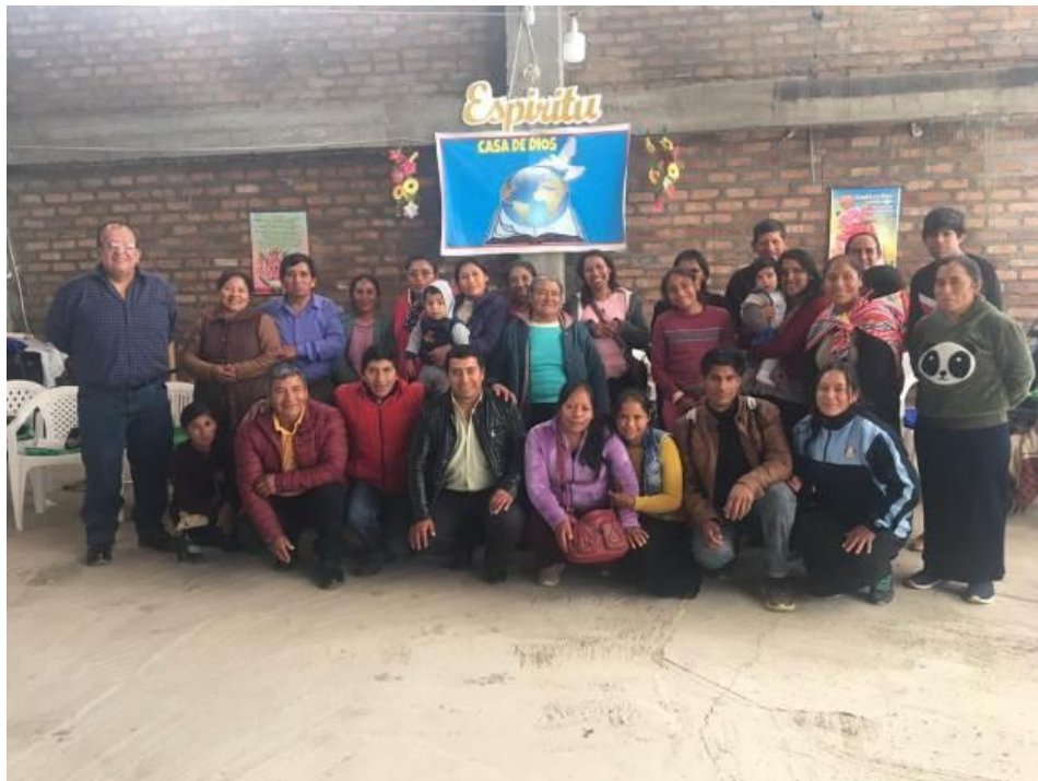
Evangelism workshop participants.