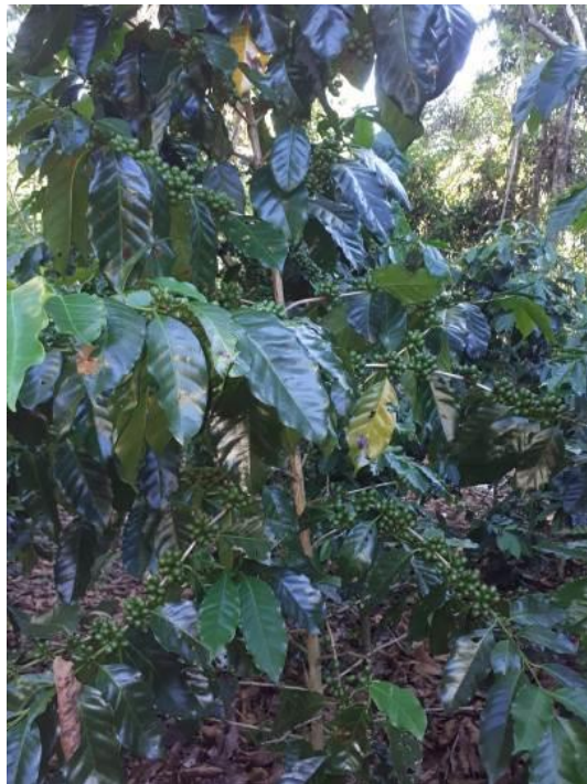
Coffee plant loaded with beans