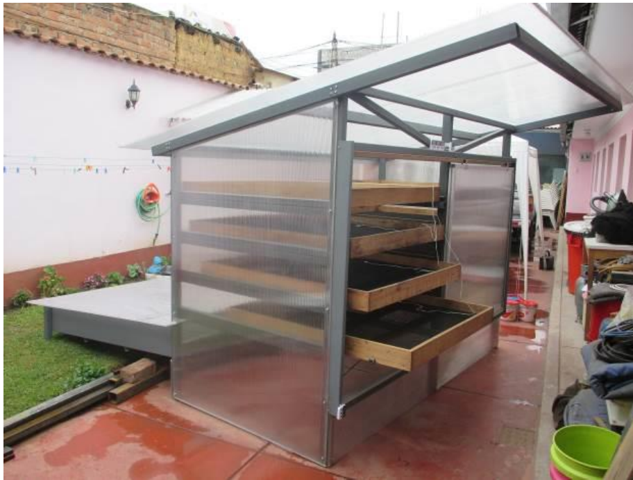
Cacao Dryer ready for additional testing and refinement.

Arthur and Moisés are still working on the cacao solar dryer to get it to work as effectively as possible, and they are doing several tests on it to improve it. Also, the hot water in our kitchen depends on the water pressure that we have, so each day when the city cuts off the water there isn't much pressure, and as a result the water heater does not work. For this reason, Arthur is designing a small water tower with a storage tank to provide water when it is cut off, and to increase the pressure so that the water heater will work all of the time. God has given Arthur many talents and gifts, and Mary Alice is so thankful for that!