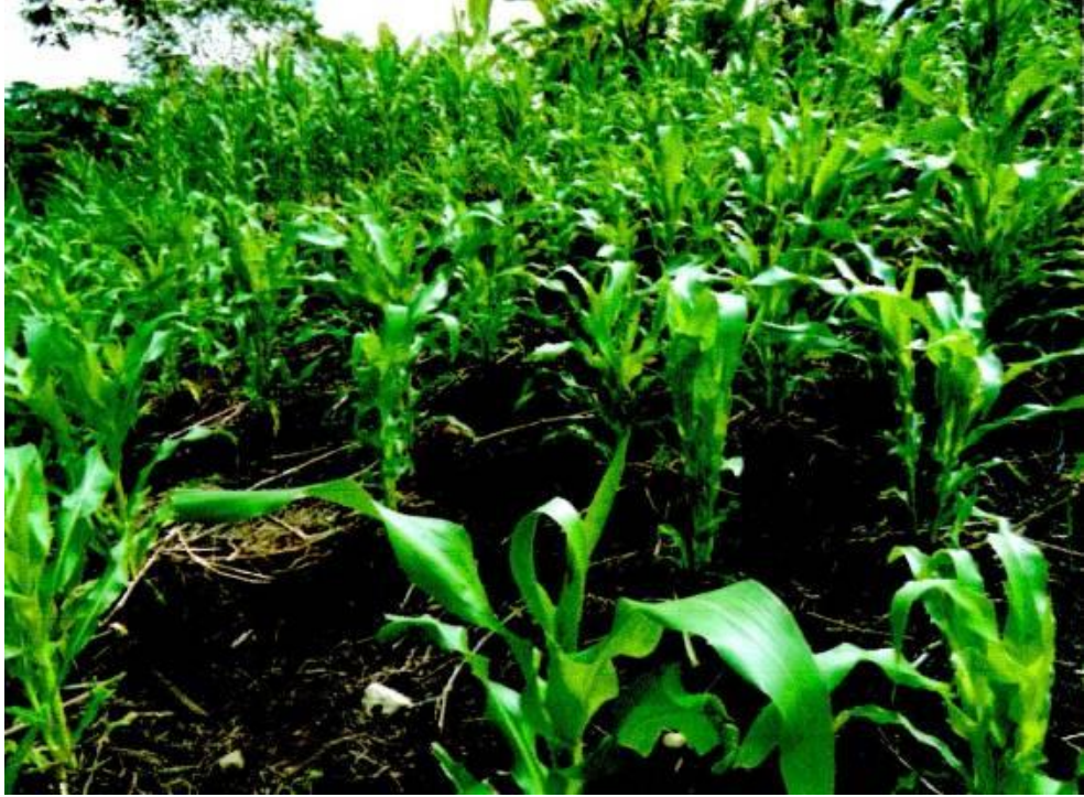
Corn growing on the farm project in the jungle.