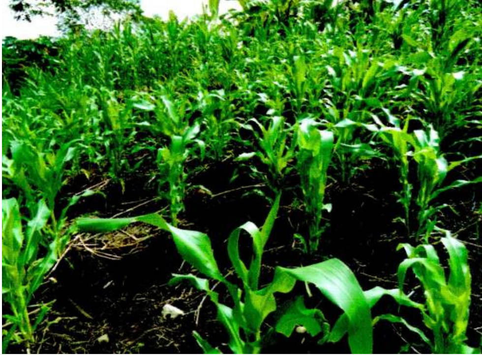
Corn growing on the farm project in the jungle.