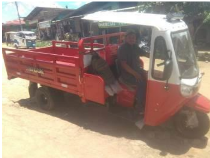
Lucio with the new “furgoneta”

The farm team finished the first chocolate bean harvest of the year, with approximately 220 kilos of dry chocolate beans. The coffee was cleared of undergrowth in preparation for pruning and the upcoming harvest. The banana plants were cleaned and sprayed to keep them healthy. In addition to the work, we were able to purchase a new “furgoneta” for the farm due to a generous gift we received.