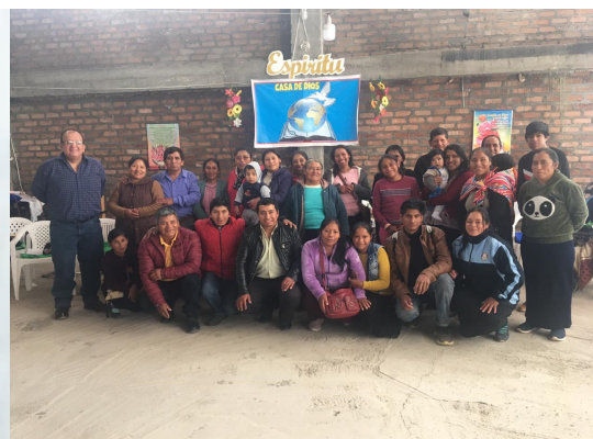
Basic Leadership workshop in Jauja.