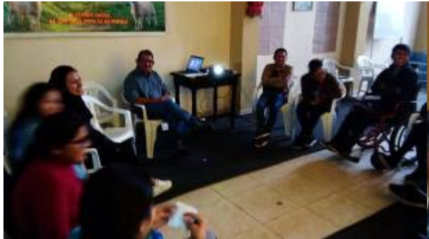
Sexual Purity workshop in San Lorenzo.